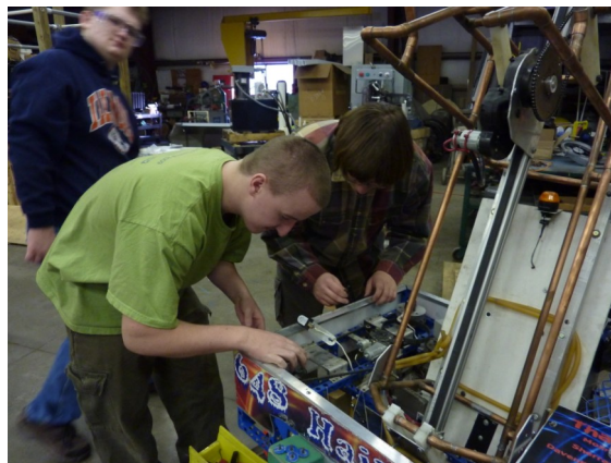
The guys checking out the setup on the old bot.